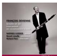
ACD2 2584 Devienne Sonatas solo recording