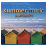
ACD2 2547 Summer Music with Pentaèdre